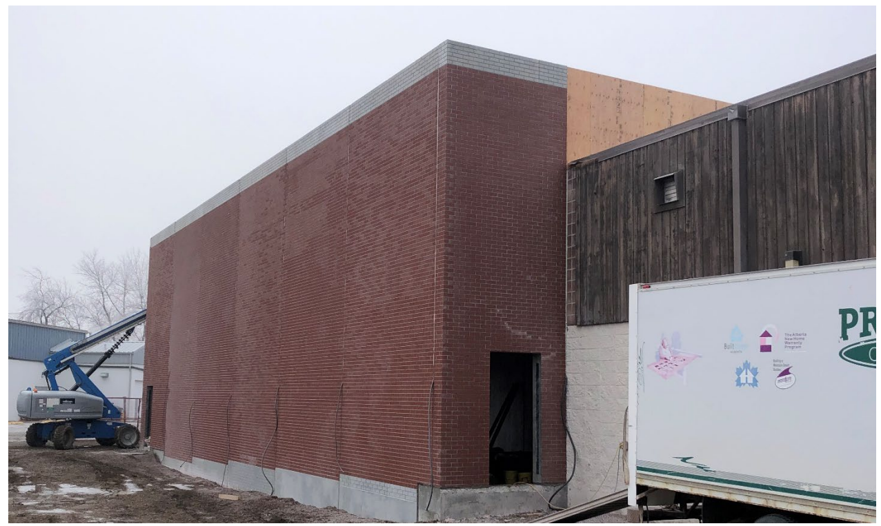
South wall progress