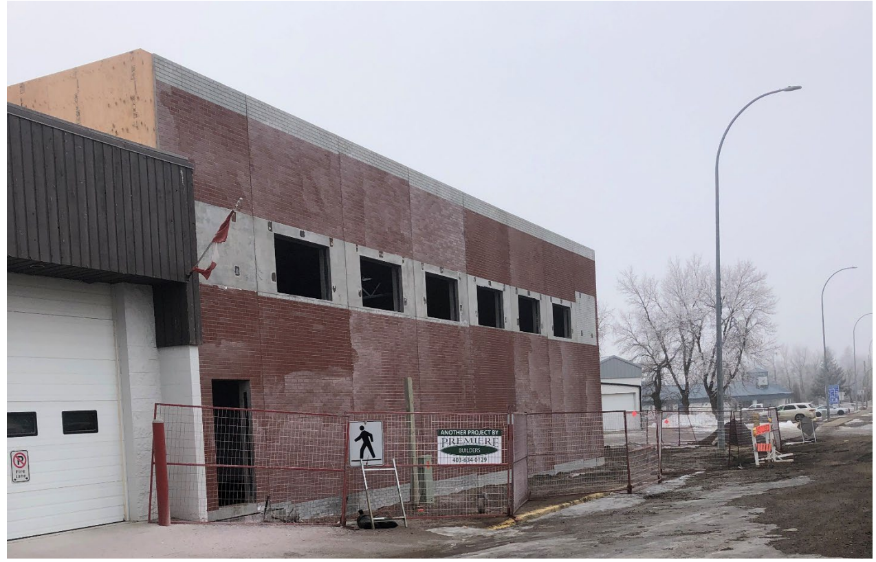
North wall progress