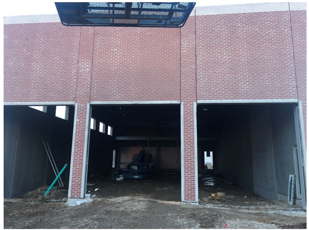
West wall progress